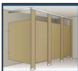
Floor Mounted/Overhead Braced

Please Circle Selection Partition Style: