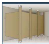
Floor to Ceiling