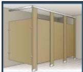
Floor Mounted/Overhead Braced

Please Circle Selection Partition Style: