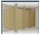
Floor to Ceiling